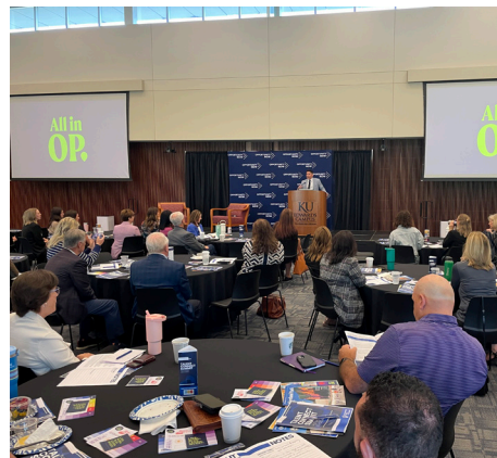
Talent Connect Summit and unveiling of All in Overland Park