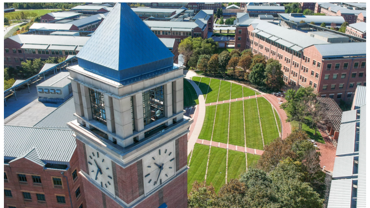
Fiserv and Security Bank announced that they would be expanding to the Aspiria Campus

This year brought significant momentum through major economic development wins that reinforce Overland Park's reputation as a premier business location. Projects such as Fiserv and Security Benefit represent more than capital investment and job creation—they signal confidence in our workforce, infrastructure, and collaborative business climate. These successes are the result of strong public-private partnerships and a shared commitment to long-term prosperity.