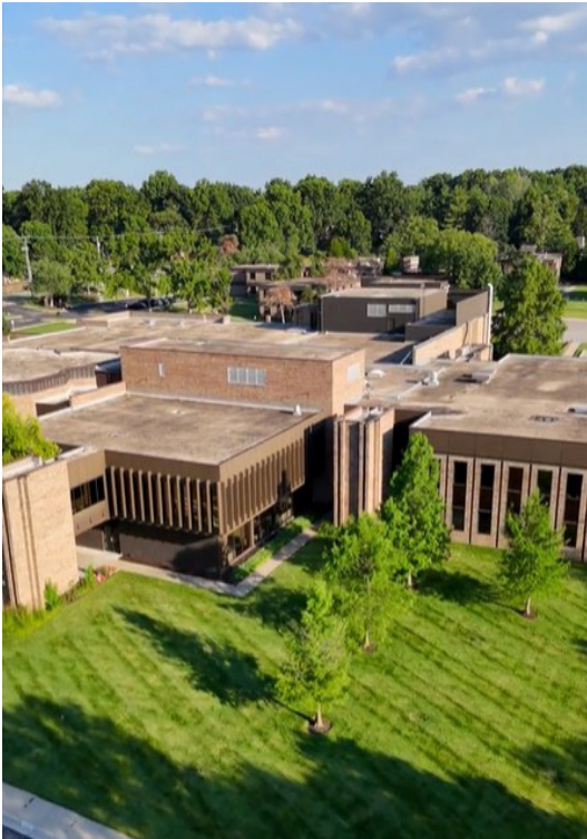
Southwind's new HQ at the former Waddell & Reed campus